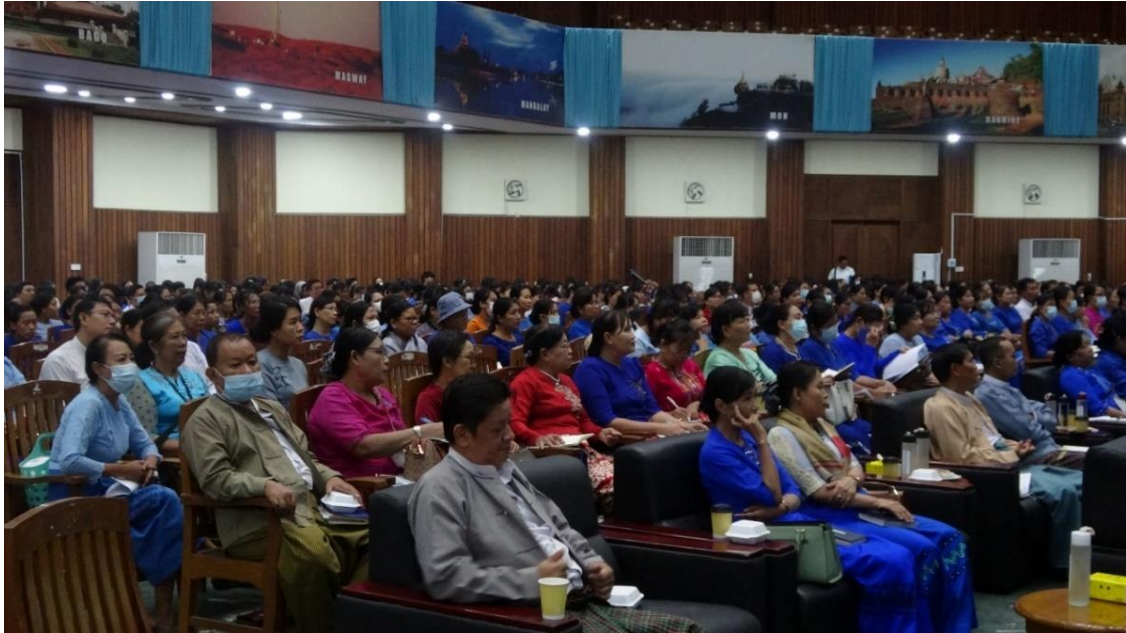
Professors, Heads of Subject Departments, Teachers and Post Graduate Candidates from universities in and around Mandalay were present on the occasion.